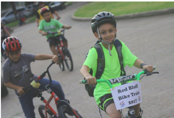
A child rides his bike in a Safe Routes to School event

Without access to safe sidewalks and bike lanes, residents do not have an outlet for exercise. Outside of infrastructure improvements on local streets, it takes creativity to expand access to active transportation options like walking and biking.