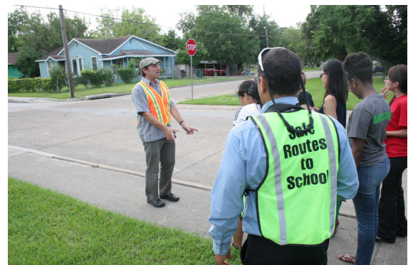
Staff offers a workshop on pedestrian infrastructure