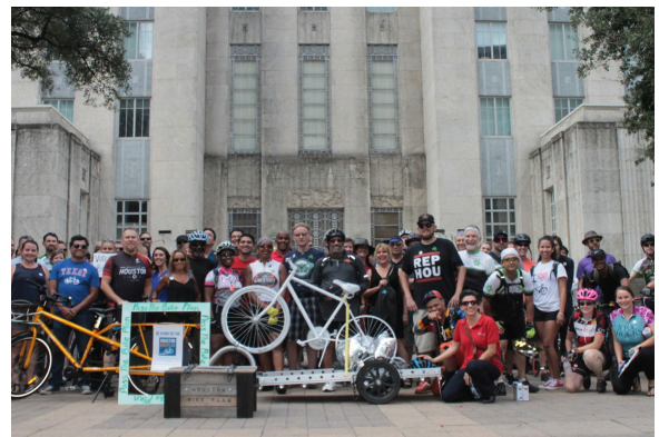
Bike Plan supporters gather at Houston City Hall