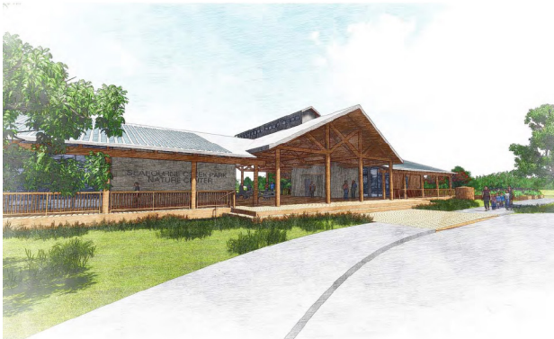
The proposed nature center will sit on preserved land

Our Region has made strides to protect natural open spaces to increase resiliency to natural disasters and to ensure unique spaces for future generations.