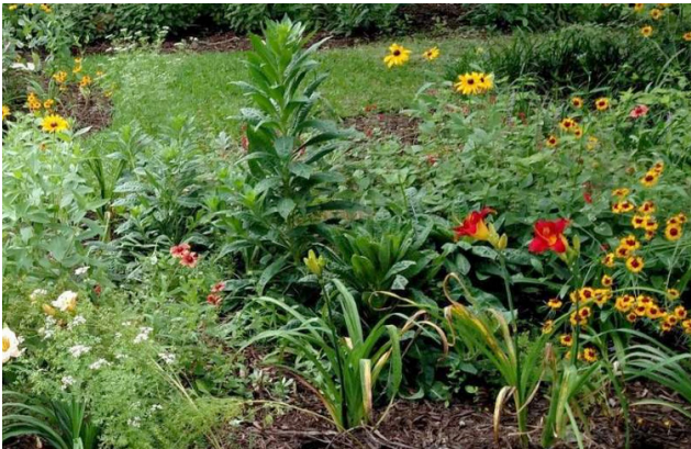
Flowers grow in a well-irrigated yard in The Woodlands

Public participation is often cited as the foundation for successful planning projects. The Woodlands Joint Powers Agency demonstrates that community organizations can work together to provide a meaningful participation process.