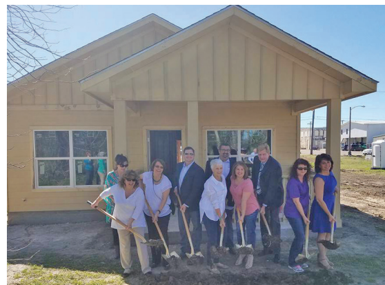
The Chamber of Commerce breaks ground on new housing