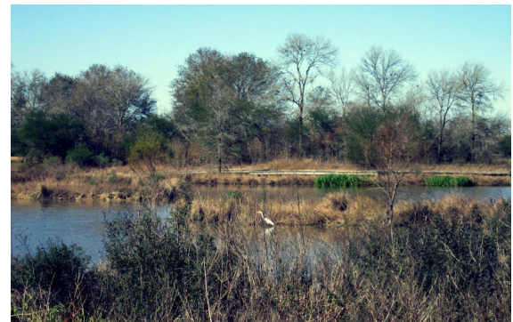
Existing Rosenberg parkland