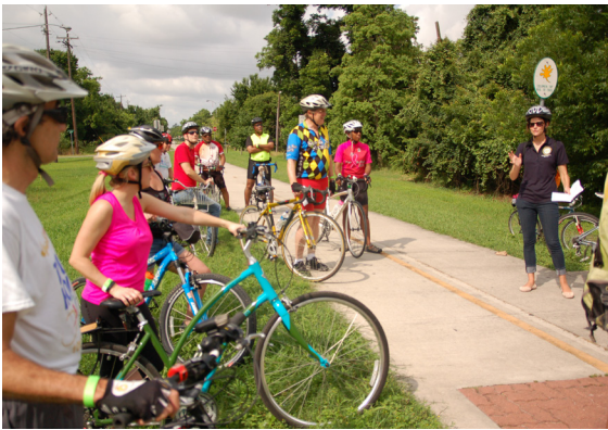
City of Houston staff host a ride for community members

Coordination is key when envisioning city-wide infrastructure, like a bike network. As a city of more than 600 square miles, the challenge becomes even greater for a place like Houston.