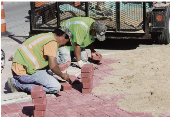
Workers install brick pavers in north downtown

Bay City Community Development Corporation