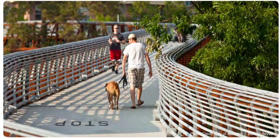
This Urban Houston Framework Study is the first of many phases in developing a comprehensive set of regulatory incentives