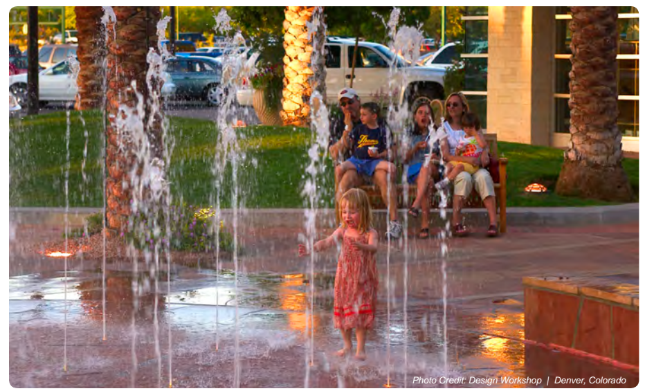
The Framework is intended to assist stakeholders interested in creating vibrant live/ work/play environments.

This Urban Houston Framework Study is the first of many phases in developing a comprehensive set of regulatory incentives that the City of Houston, as well as its regional partners, can use to selectively encourage dense, sustainable neighborhoods in appropriate locations, while protecting the character of existing, stable residential communities.